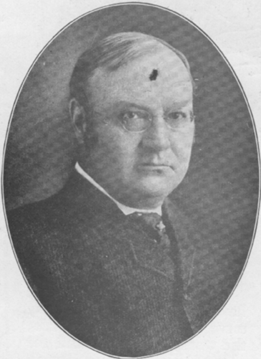
James Schoolcraft Sherman (Vice-president 1909-1912)