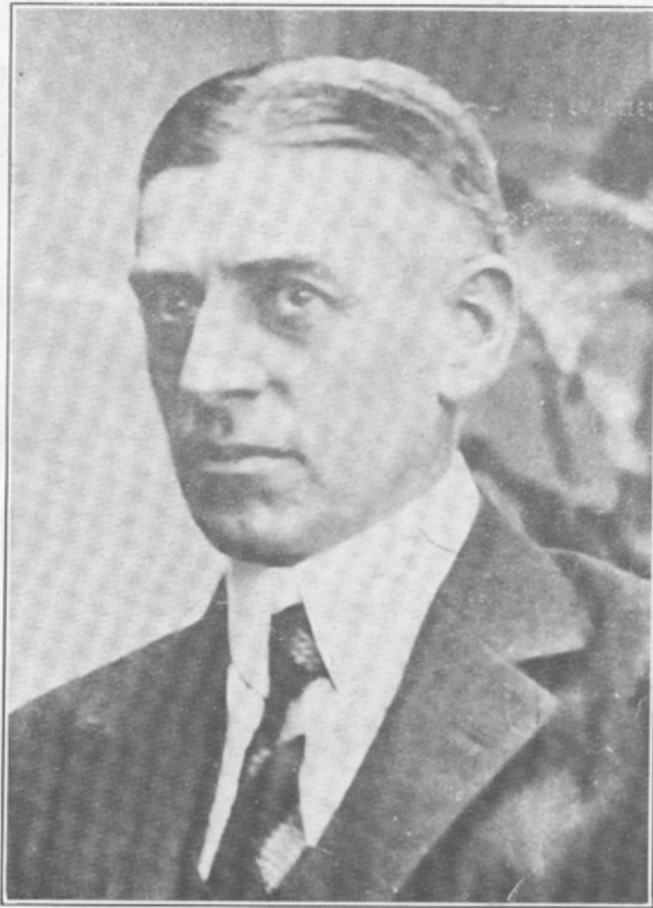
CHARLES JAMES RHOADES NEW COMMISSIONER OF INDIAN AFFAIRS