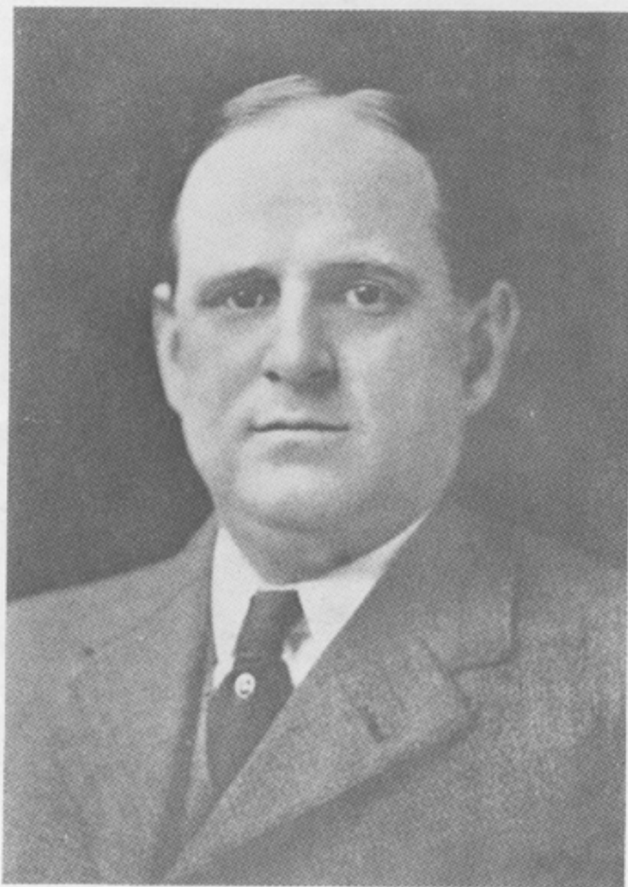
J. HENRY SCATTERGOOD New Asst. Commissioner Of Indian Affairs