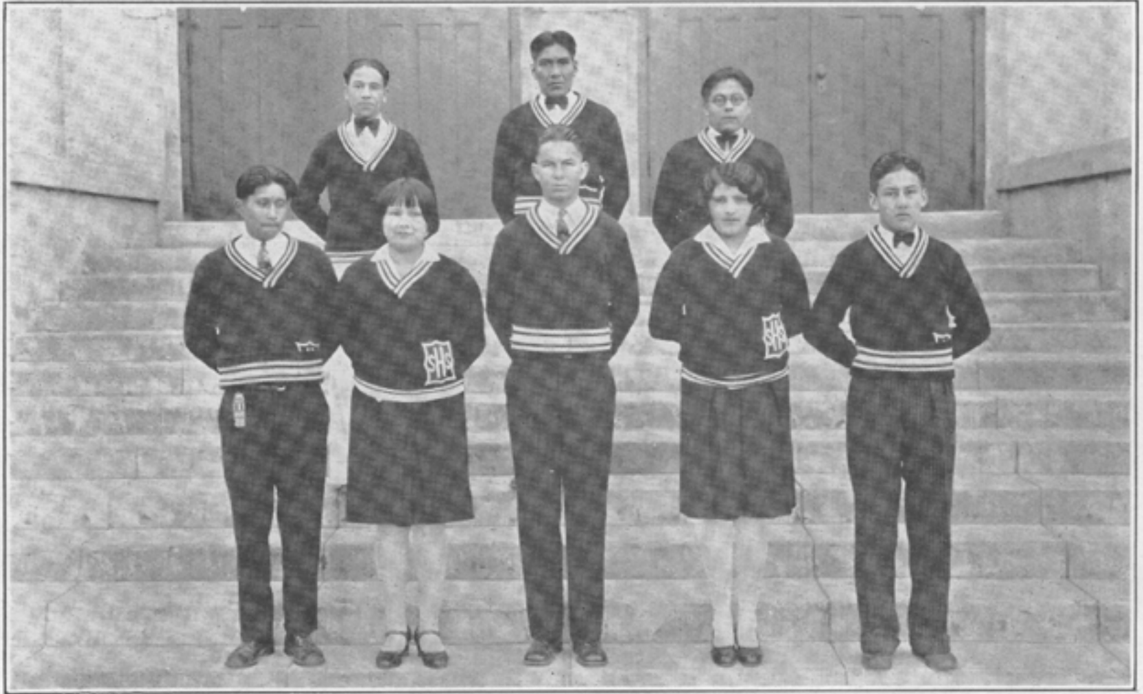
Purple and Gold Staff